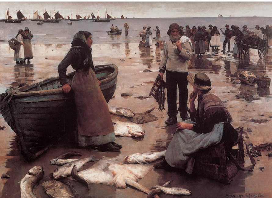
“Fish Sale on a Cornish Beach” (1885)