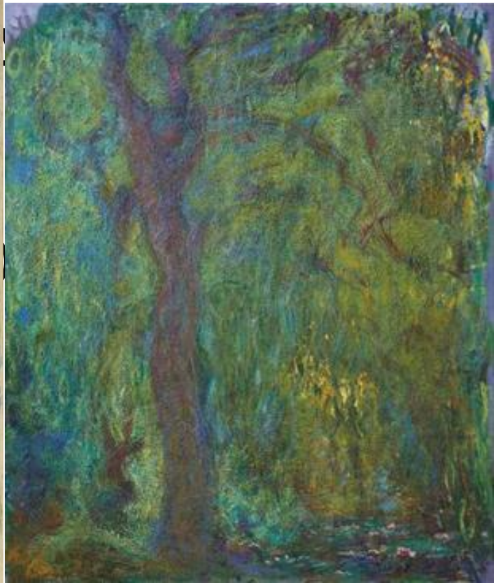
"Weeping Willow" (1919)