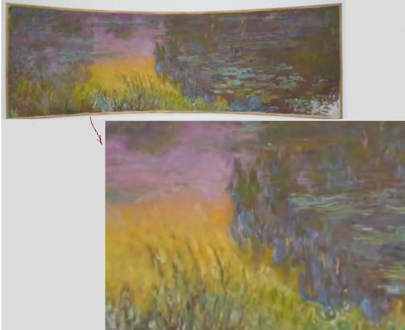
“Nimpheas/ Water Lilies” (1926) at the Orangerie