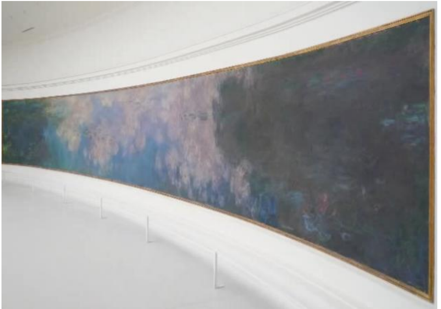
“Nimpheas/ Water Lilies” (1926) at the Orangerie