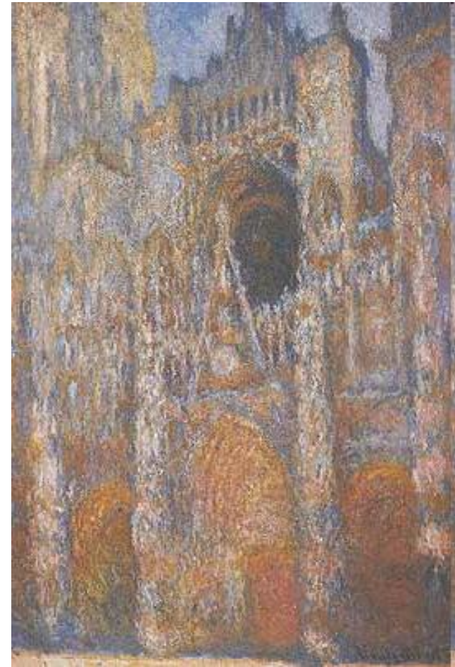
"Cathedrale de Rouen" (1894)