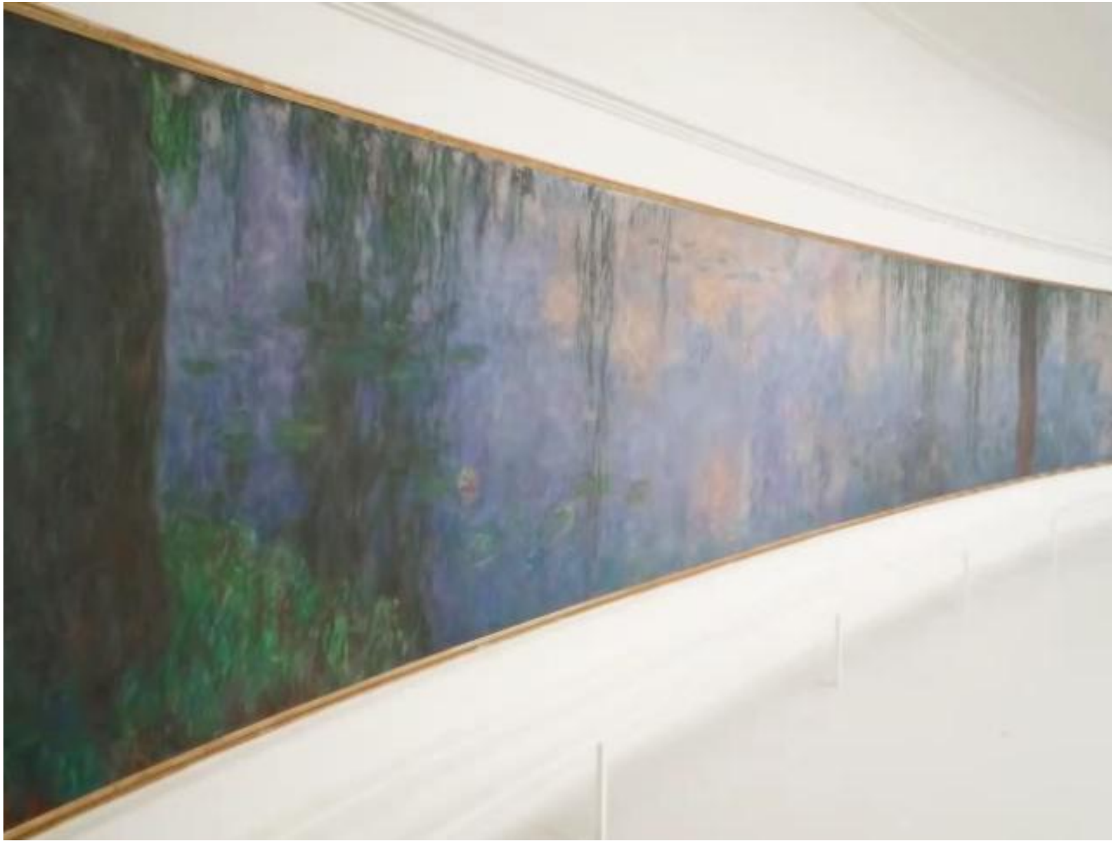
“Nimpheas/ Water Lilies” (1926) at the Orangerie