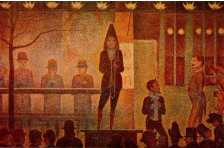
“La Parade du Cirque” (1888)