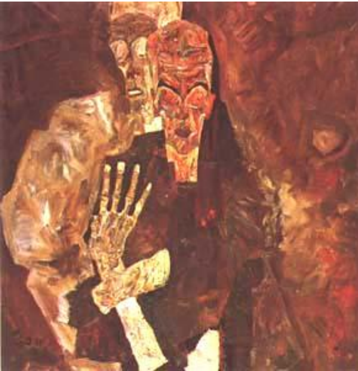
Expressionism – Egon Schiele (1890, Austria)