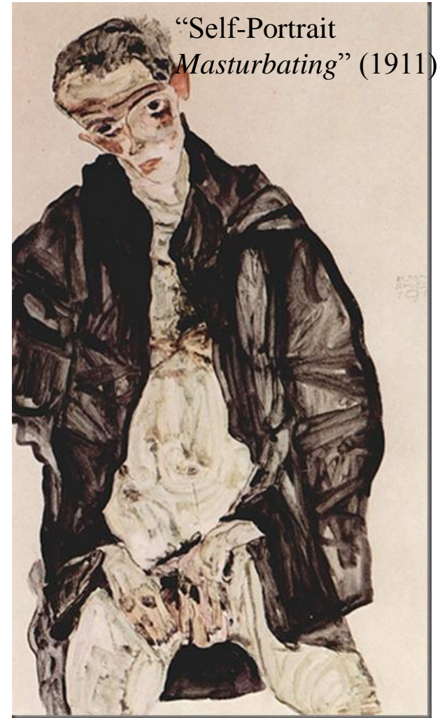
“Self-Portrait Masturbating ” (1911)