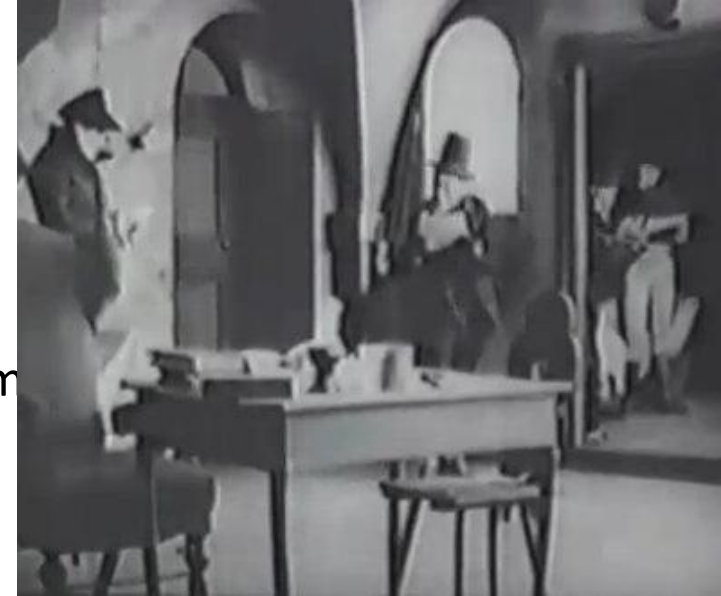
“The Student from Prague” (1913)