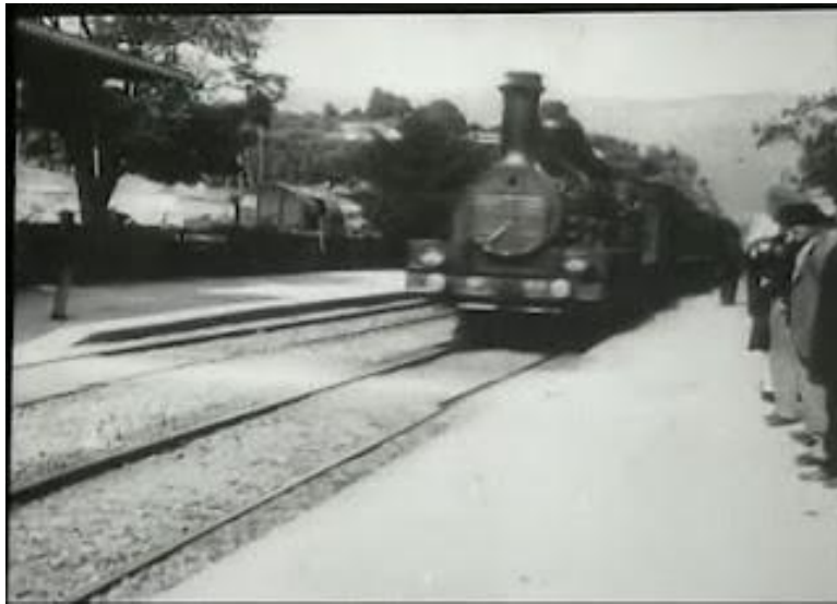
“The Arrival of a Train at La Ciotat Station” (1896)