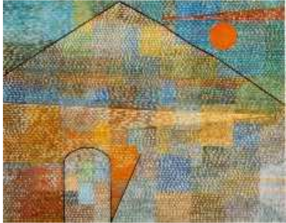
“Ad Parnassum” (1932)