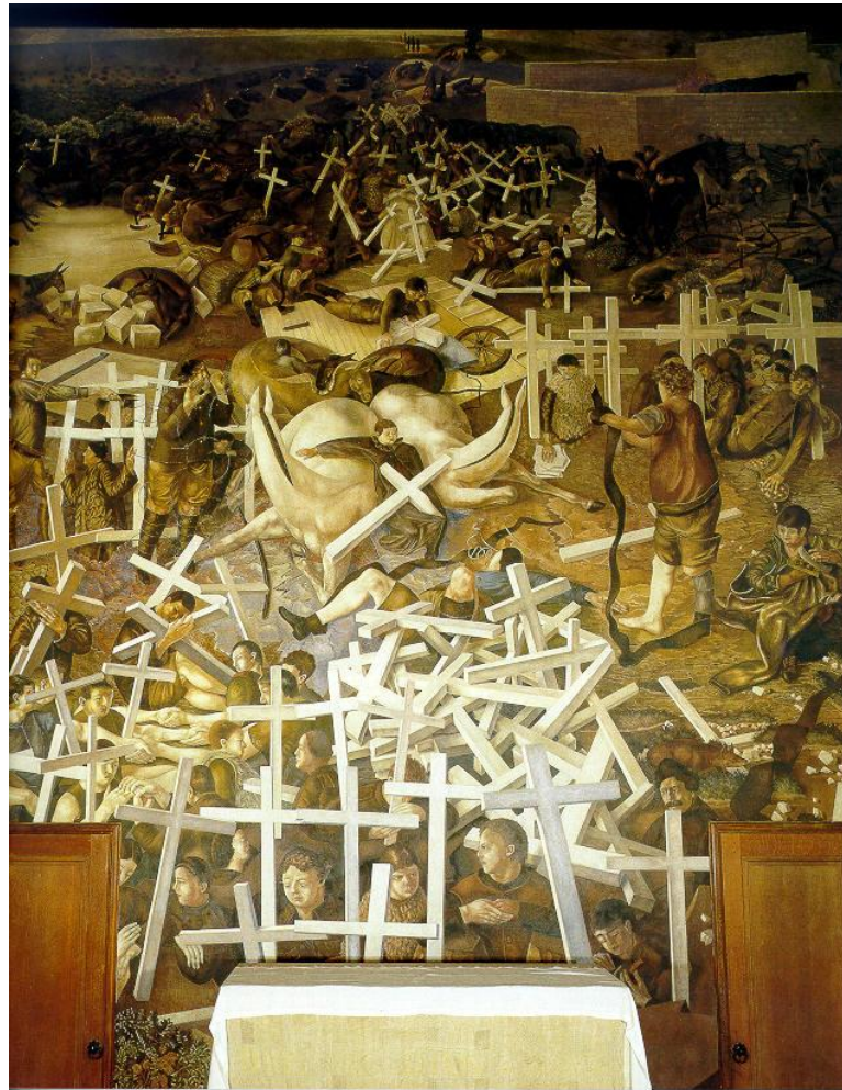
“The Resurrection of the Soldiers” (1929)