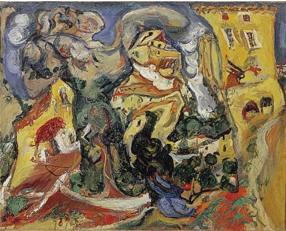
"The Village" (1923)