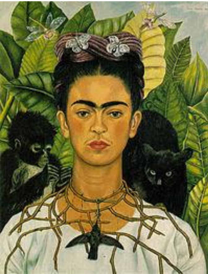
“Self-portrait with Thorn Necklace and Hummingbird” (1940)