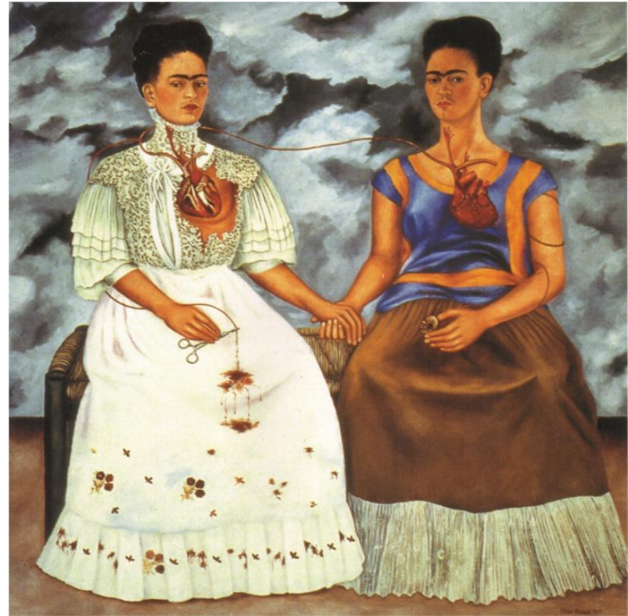
“The Two Fridas” (1939)