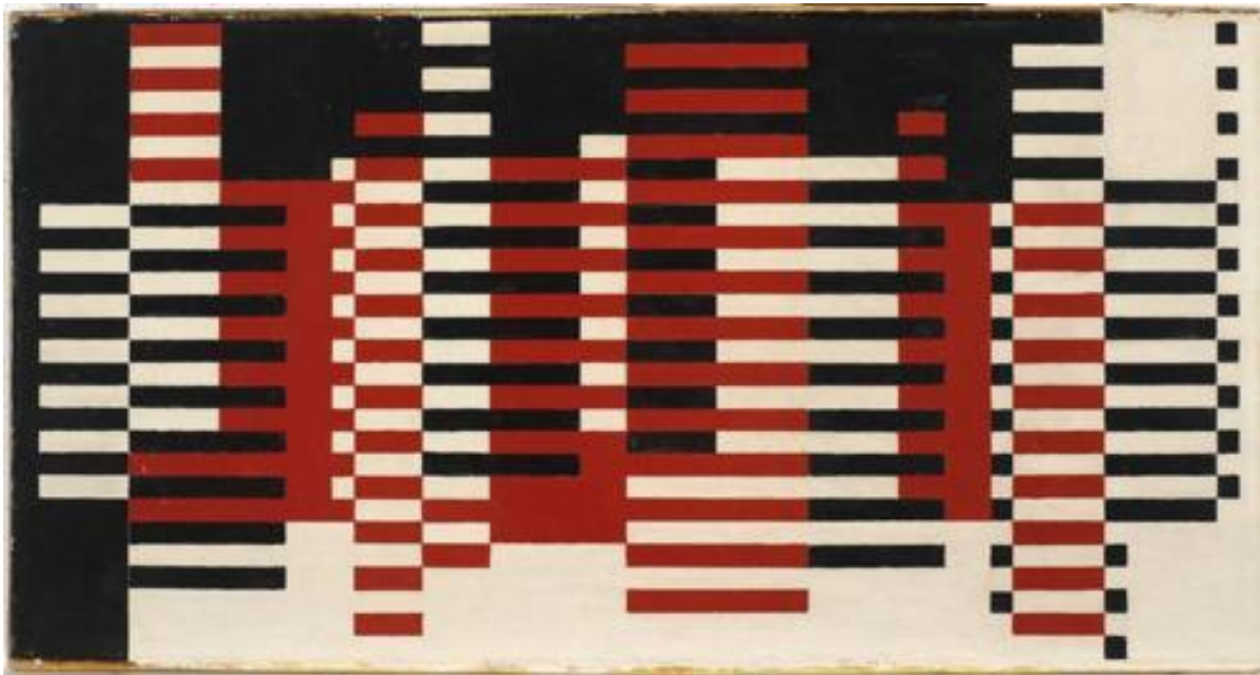
“The City” (1928)