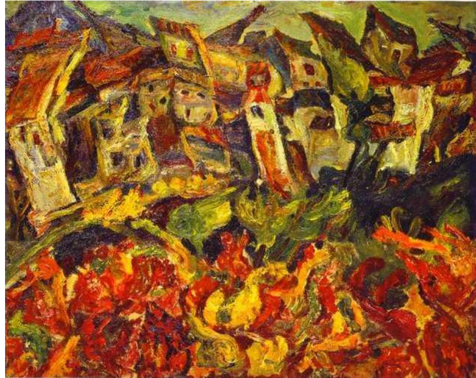
"Houses with Painted Roofs" (1921)