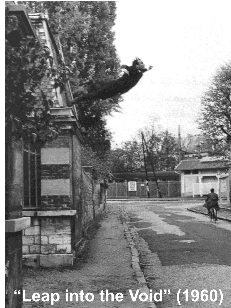
“Leap into the Void” (1960)