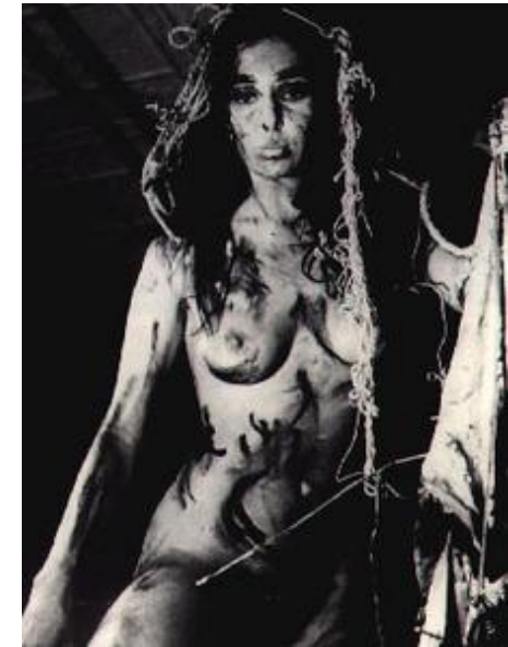
“Eye Body” (1963): The artist covers her body in grease, chalk and plastic in a chaotic dilapidated loft