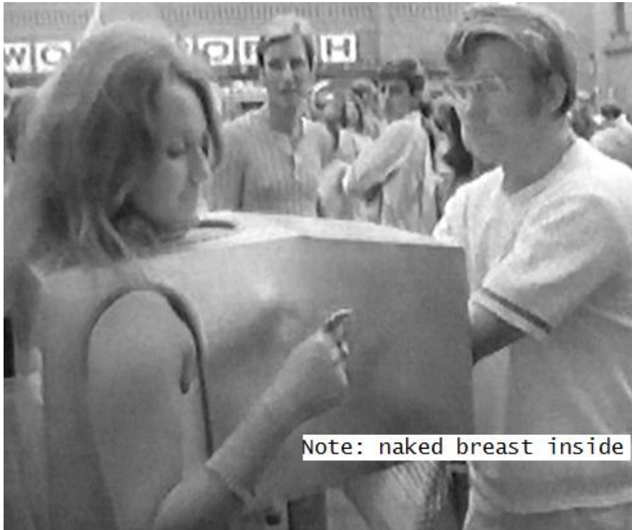
"Tap and Touch Cinema" (1968)

Carrying a gun and wearing pants with a large hole at the crotch exposing her genitals, a woman enters a theater where a porno movie is being shown and demands that the spectators have sex with her instead of watching the movie.