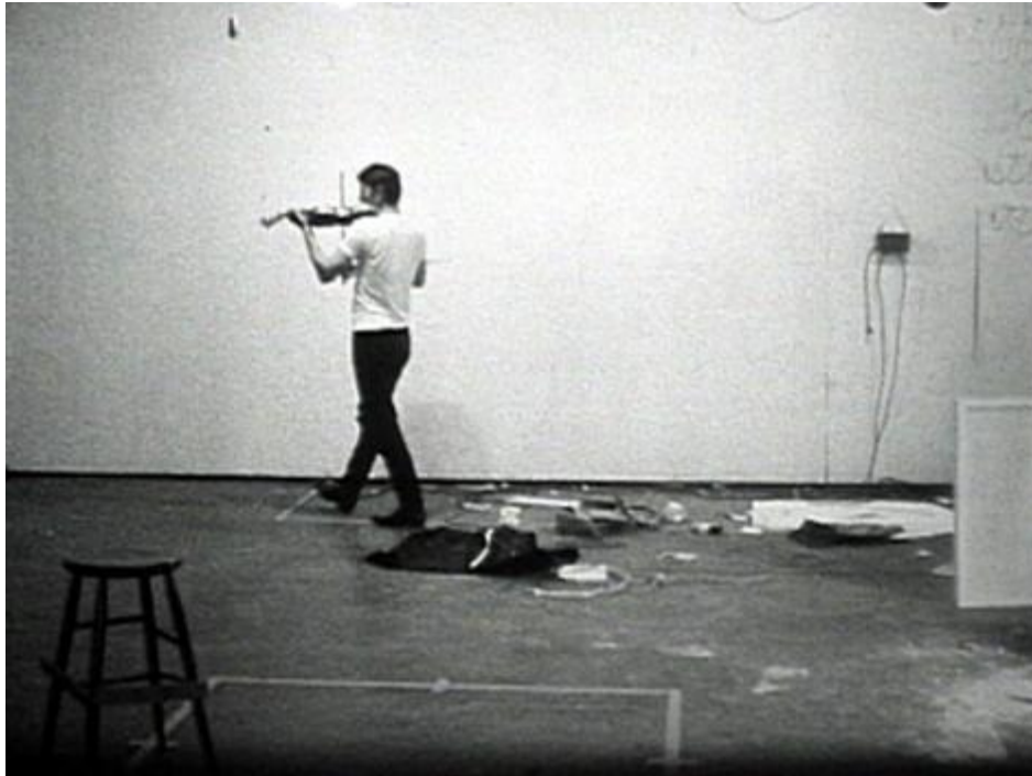
"Playing a Note on the Violin While I Walk Around the Studio" (1968): video of the artist playing violin in his studio