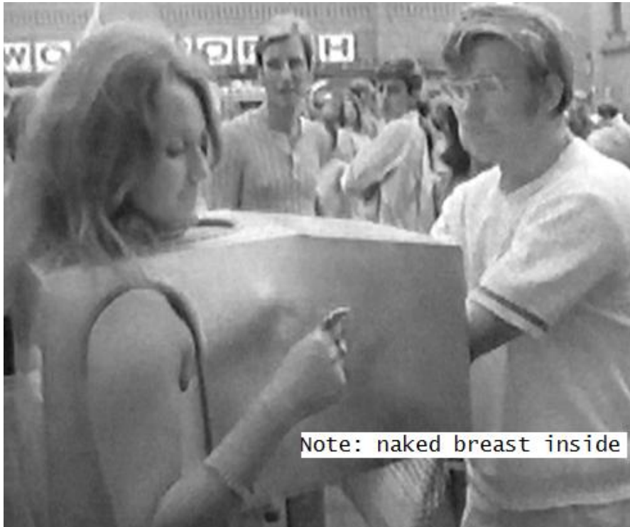
"Tap and Touch Cinema" (1968)

Carrying a gun and wearing pants with a large hole at the crotch exposing her genitals, a woman enters a theater where a porno movie is being shown and demands that the spectators have sex with her instead of watching the movie.