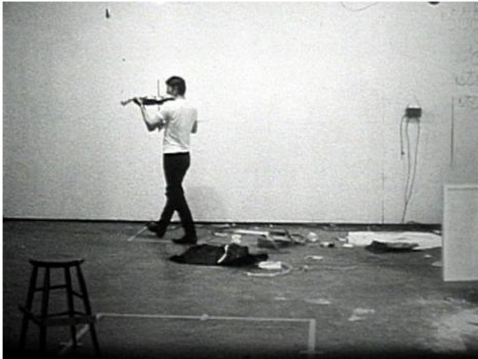
"Playing a Note on the Violin While I Walk Around the Studio" (1968): video of the artist playing violin in his studio