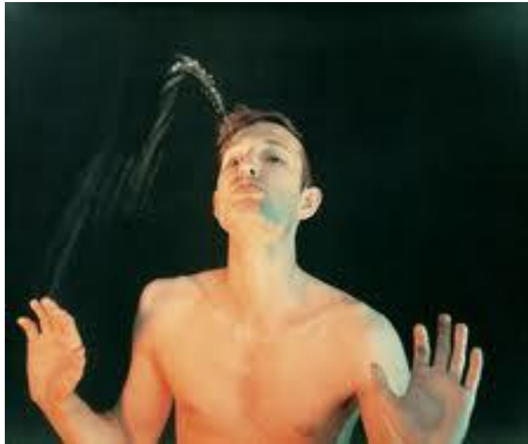
“Self Portrait as a Fountain” (1966)