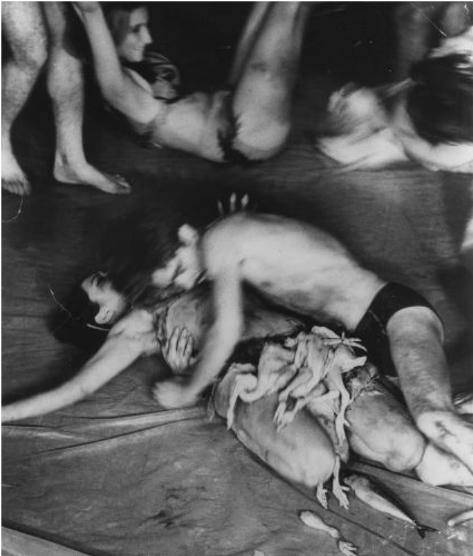
“Meat Joy” (1964): eight naked people dancing and playing found objects