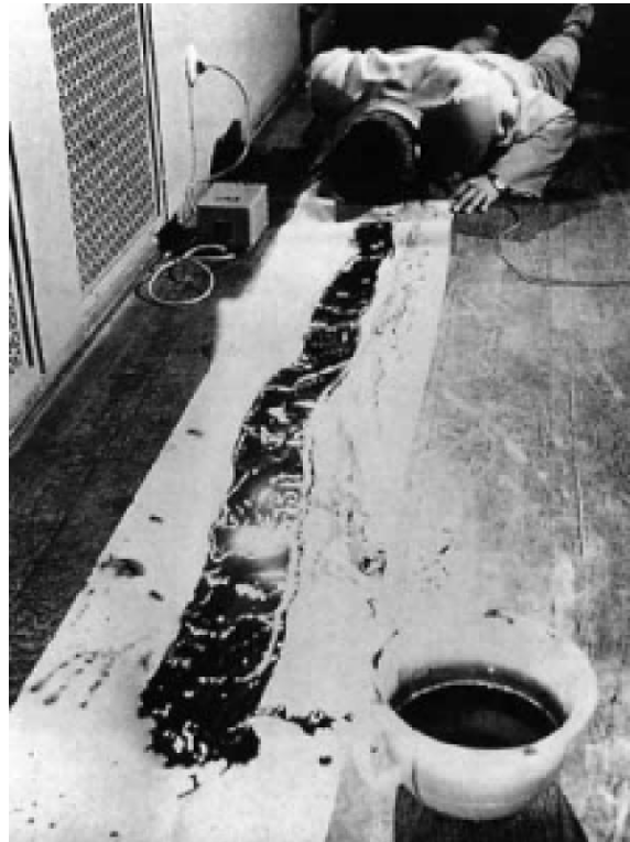
"Zen for Head"