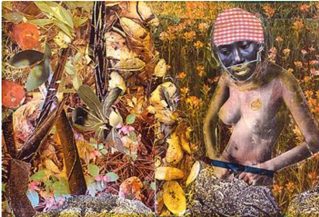
“Blue Shade” (1972)