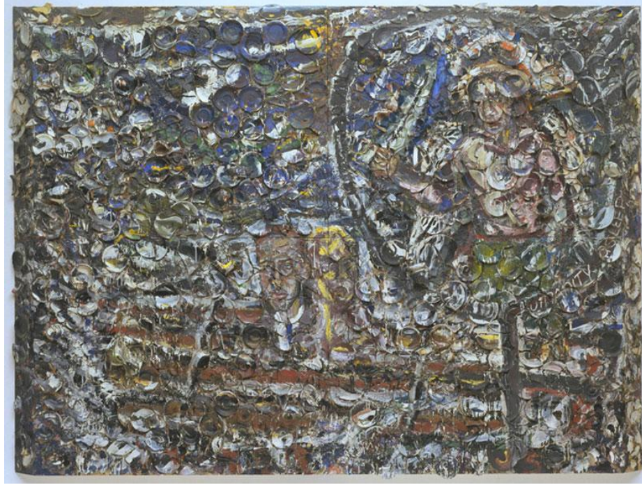
“Humanity Asleep” (1982)