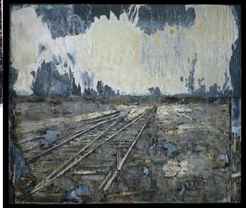
“Lot's Wife” (1989)