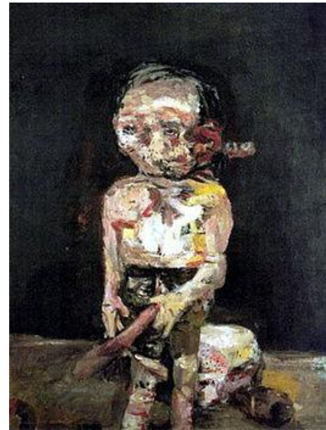
“The Big Night Down The Drain” (1963)