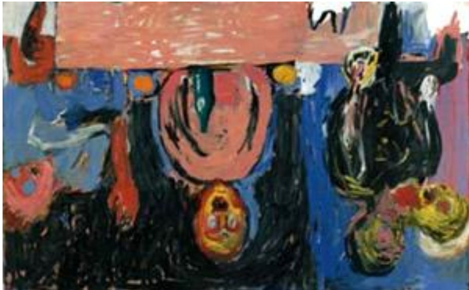
“Dinner in Dresden” (1982)