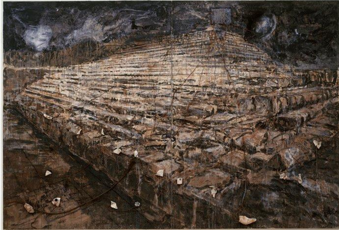
“Osiris and Isis” (1987)