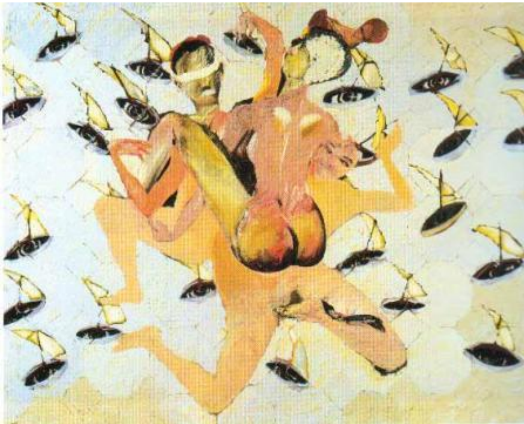
“Midnight Sun II” (1982)