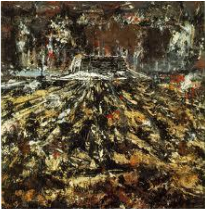
“To the Unknown Painter” (1983)