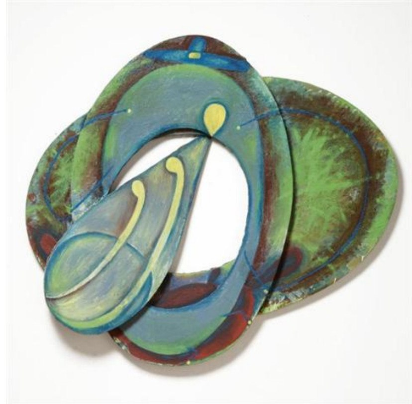
"The Hat Makes the Woman" (1985)