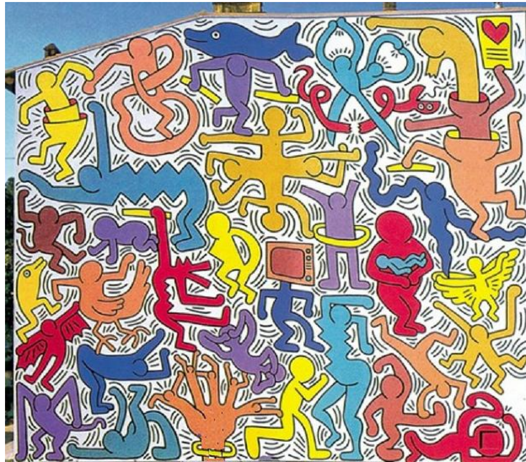
("Tuttomondo" mural (1989) Sant'Antonio Abate in Pisa