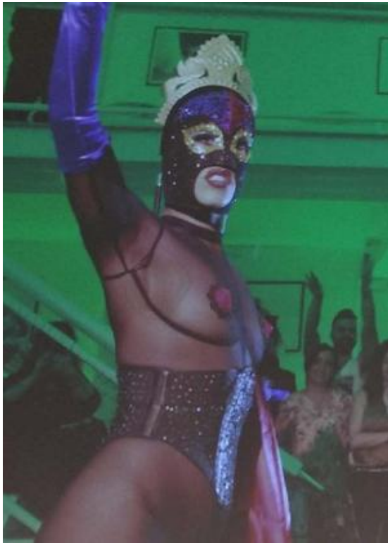
Dominatrix of The Barrio (2002)