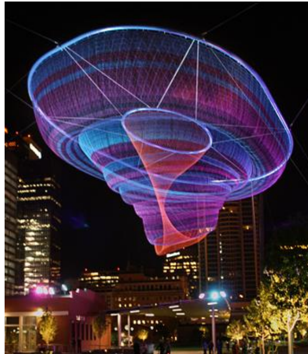
“Her Secret Is Patience” (2009)