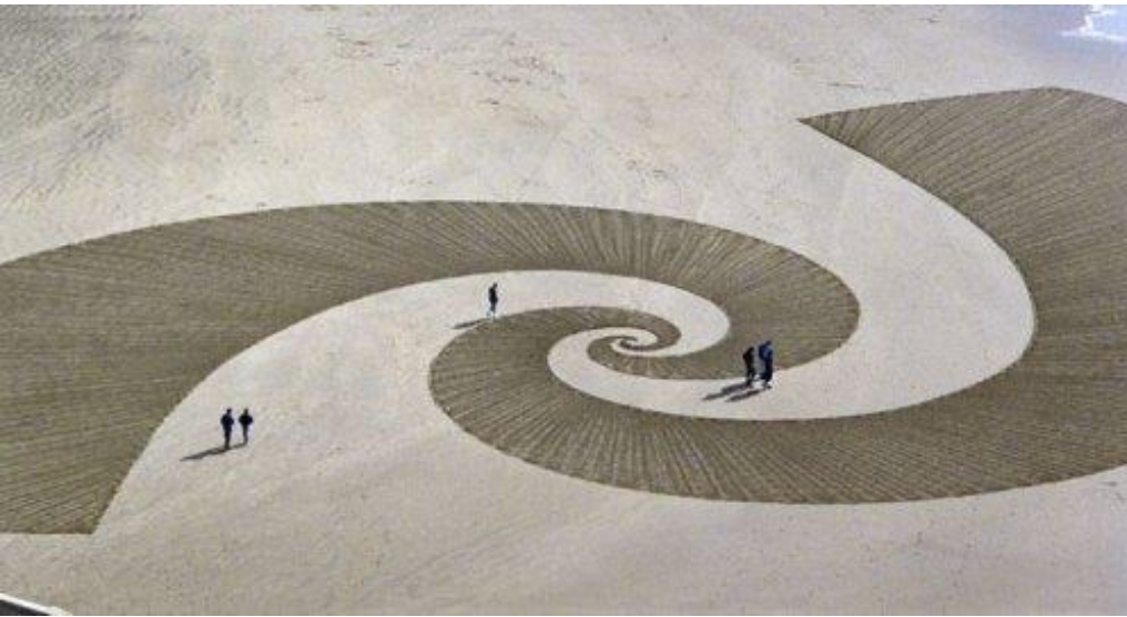
Ocean Beach, San Francisco