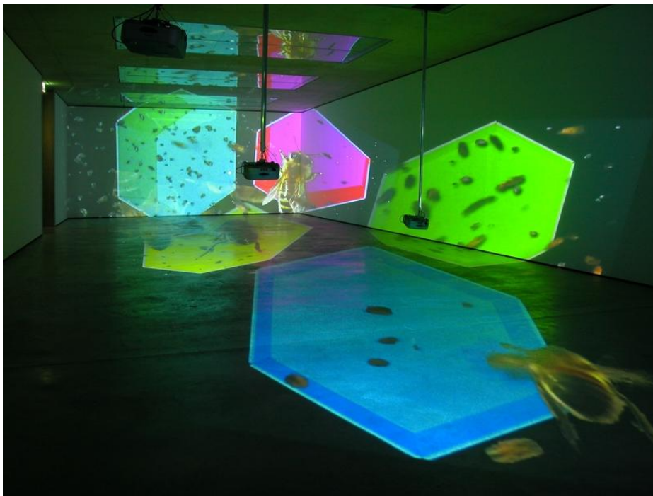
“Knots + Surfaces” (2001)