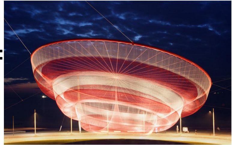
“She Changes” (2005)