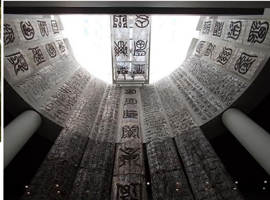
"Babel of the Millennium" (1999)