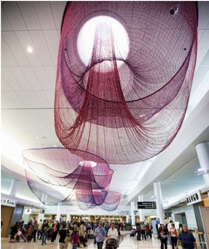
“Every Beating Second” (2011)