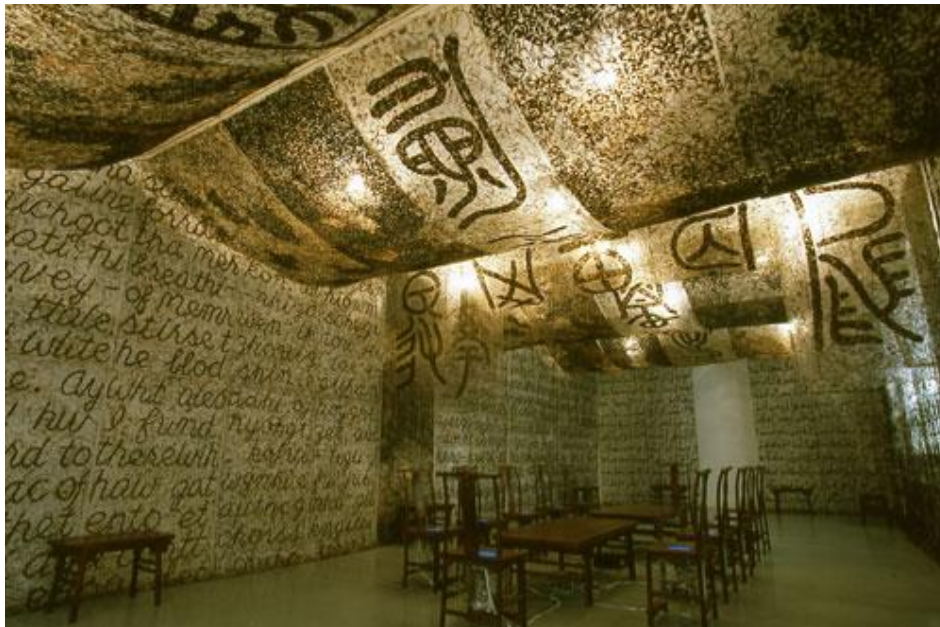
"Temple of Heaven" (1998)