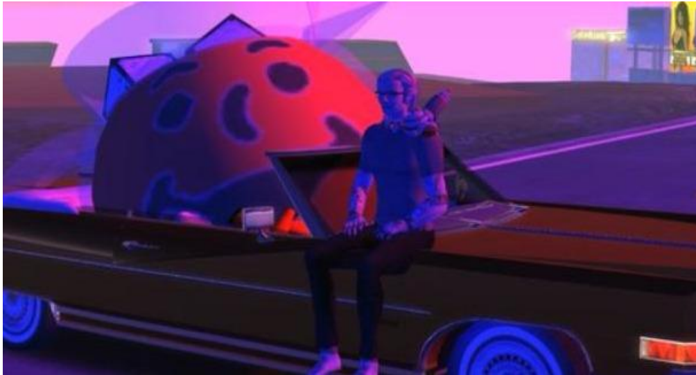
Rafman: Kool-Aid Man (2008)