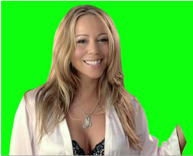
“Touch My Body ” (2008)