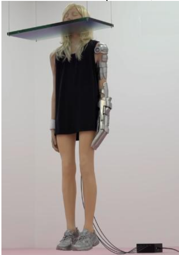
"Some Pheasants in Singularity" (2014)