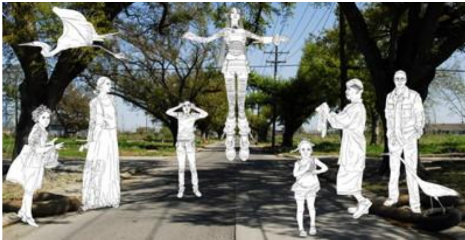
Fei: RMB City (2008)