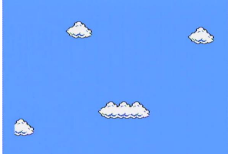
“Super Mario Clouds” (2002)