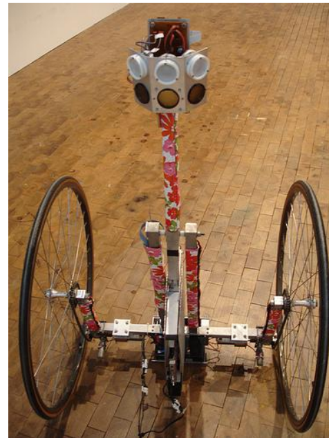
“Petit Mal” (1993)