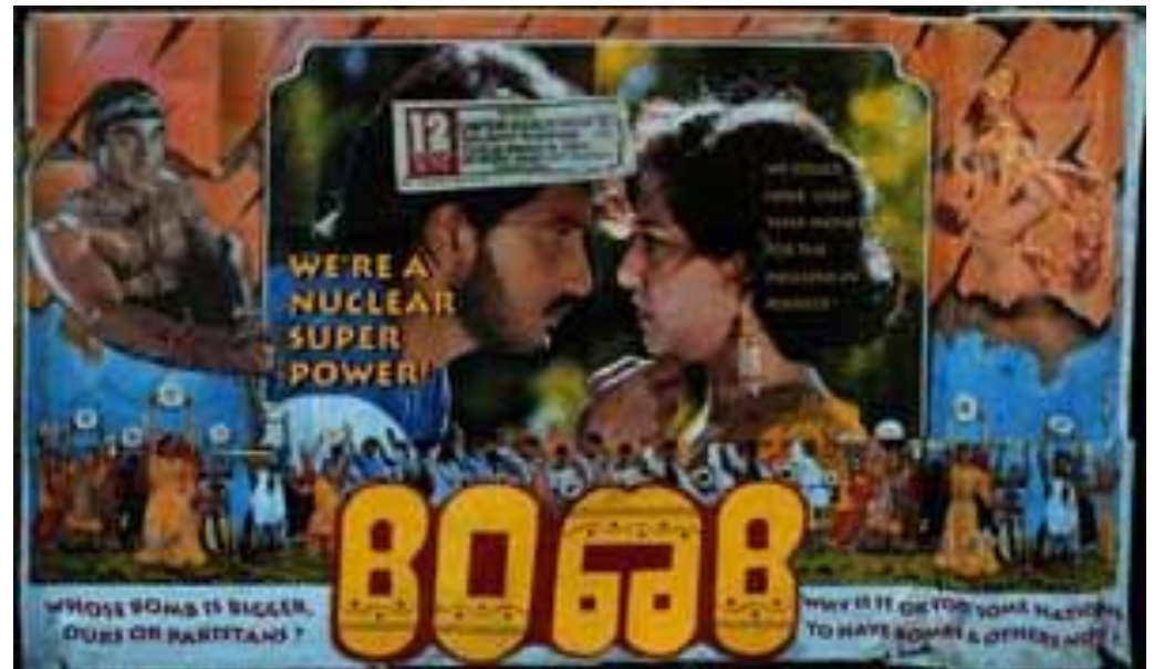
“I Love Calpe 5” (1999)