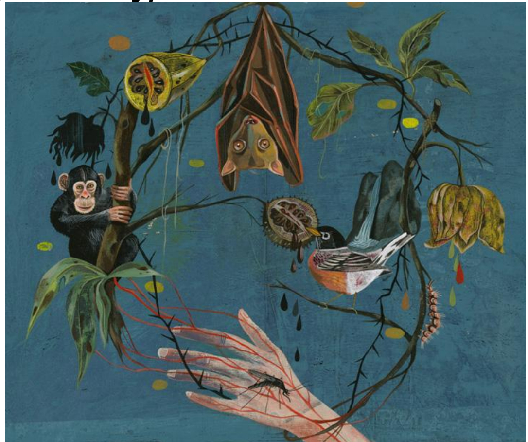
New York Times (2012)